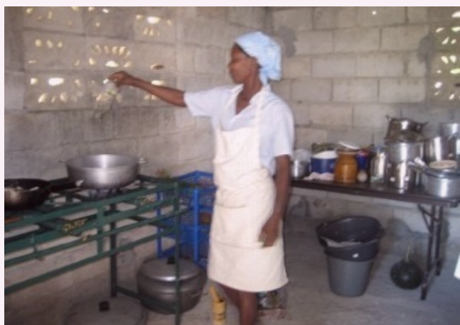
the all important kitchen of the school

On Sundays we bring communion to the elderly who cannot move from their homes. We pray with them, sometimes in collaboration with the other religious of Fond Parisien (Society of Daughters of the Immaculate Heart of Mary). In addition to these fundamental nuclei, we have worked on specific projects such as the construction and operation of the Belle Fontaine hospital (in the mountains), the