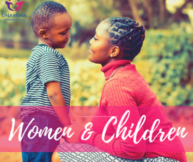
Women & Children