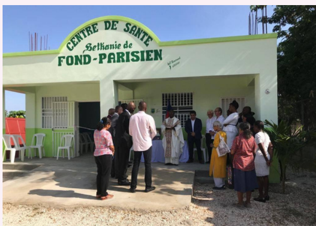
the blessing of the health clinic

reverse osmosis system and is distributed in carafes. The health center is more recent, still incipient. We perform consultations, treatments, and ultrasounds, and are in the process of setting up a laboratory. There is a great need for physical therapy. School and health centers attract people from all neighborhoods in and around Fond Parisien. The chicken cooperative had been running until lockdown. The situation of socio-political violence is making its continuity impossible.