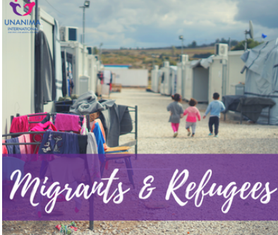
Migrants & Refugees